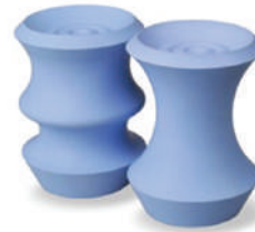
Pigs (pipe-cleaning devices)

Product modifications are no problem for us either. For example, the dead spaces of lip seals can be lined with silicone in order to allow for use in the food industry. The adherence of production residues and the formation of microfilms are thereby excluded.