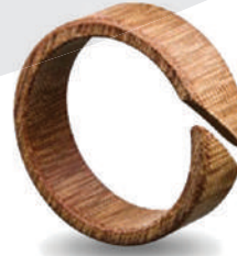
Piston guides made of laminated fabric