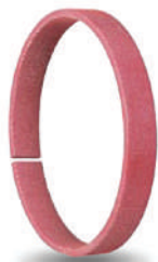
Guide belts made of laminated fabric