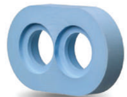
Formed parts made for the medical industry

Contact North Coast Seal today for more information