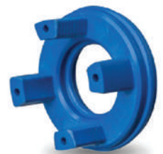
Formed parts made of PU