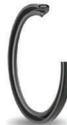
Radial shaft seal, particularly suitable for working rolls in steel works

NCS offers 10 product lines for heavy industry applications that are currently available in the fast delivery service – continuous, cut or precision-joined. The basic rings come from the series production. Guide belts and V-shaped packings are cut to measure and supplied open. A specially developed joining method allows individual diameter specifications for wipers, deflectors and radial shaft seals.