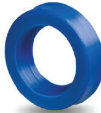
Reduced friction rod seal made of PU