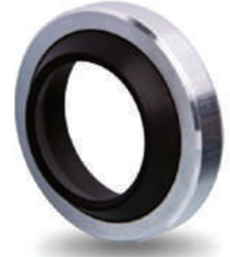
Wipers (e.g. NBR) with aluminum housing