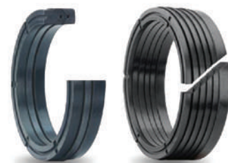
V-shaped packing seal sets, particularly for cylinders in existing installations