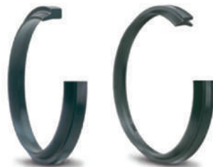
Wipers with support elements or with additional sealing function