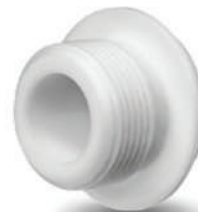
Formed parts made of POM