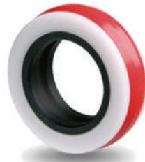
Compact piston seals made of NBR/PU/POM