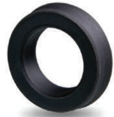
Elastomer rod seal