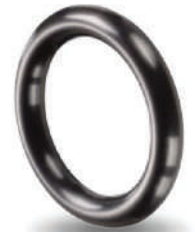
O-rings (e.g. EPDM or NBR)