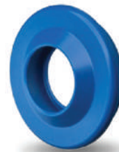
Formed parts made of PU