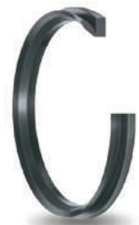
Innovative deflector, replaces V-rings in demanding applications