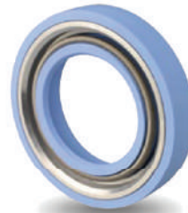
Rapid Machined Radial Shaft Seal

The materials that come into contact with food or pharmaceuticals conform to FDA guidelines and are approved in accordance with global standards such as USP and NSF.